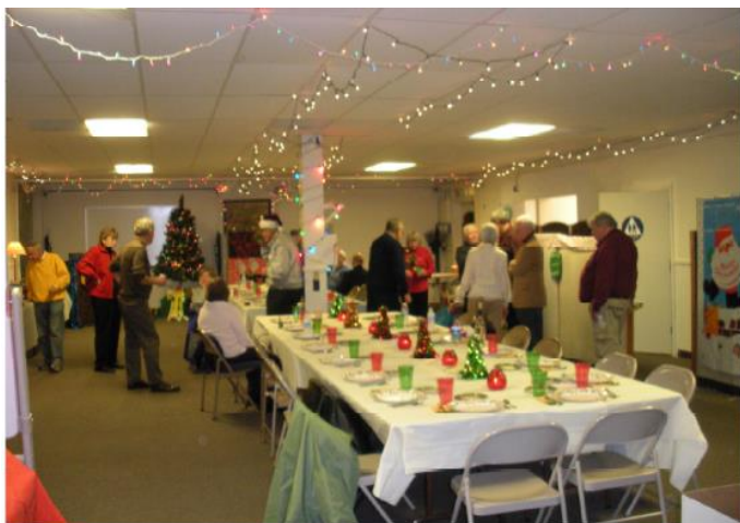
Christmas Party 2009

December 17, 2014 17:30 (5:30 PM) - MARS Clubhouse, 27 Shell Rd, Mill Valley, CA 94941